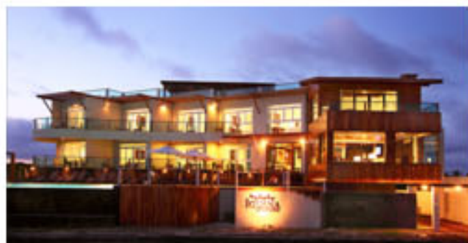
Guy Harvey Outpost New Resort

Guy Harvey Outpost Resorts announced today the company's entry into in the Galapagos Islands, with hotel projects on the islands of San Cristobal and Isabela. The Galapagos National Park 600 miles off the coast of Ecuador is a bucket-list destination for travelers seeking truly unique wildlife interaction.