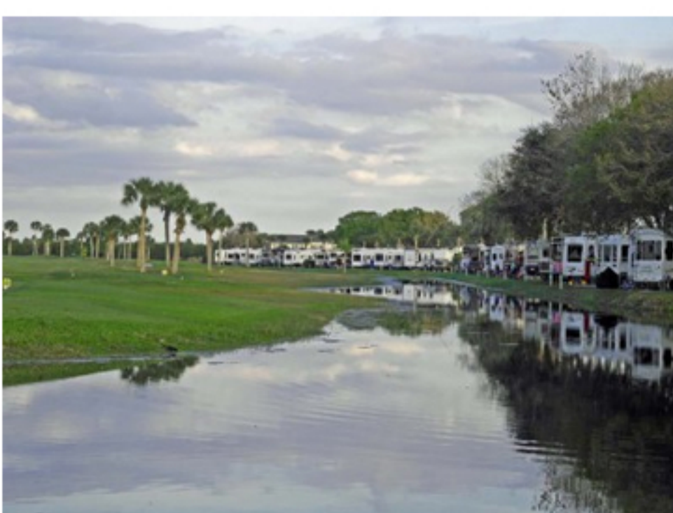
Waterfront RV sites

SHARE Facebook Twitter G+ Pinterest Like 0 Tweet