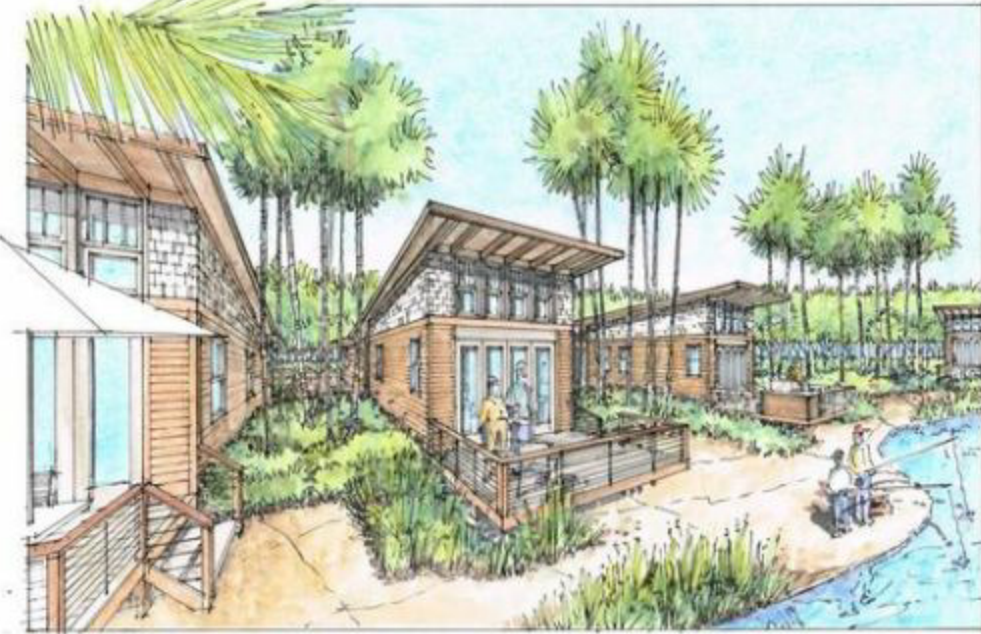
Artist rendering of the resort cottages for sale at the new Guy Harvey Outpost Club & Resort Tarpon Springs.