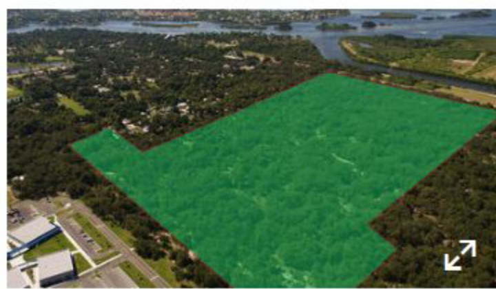
The site of the new Guy Harvey Outpost resort near Tarpon Springs.

Sales will open in March and deposits taken from interested buyers for the loft-style one-and two-bedroom solar-paneled cottages. Prices for the 400-to-500-square foot cottages, which can be purchased fully furnished and equipped, start at $250,000. Meanwhile prices for the 3,200-square-foot RV lots start at $150,000. The RV lots come equipped with 100-amp electric service, cable, water and sewer. Owners also have the option of putting their cottages and lots in the club's rental program.