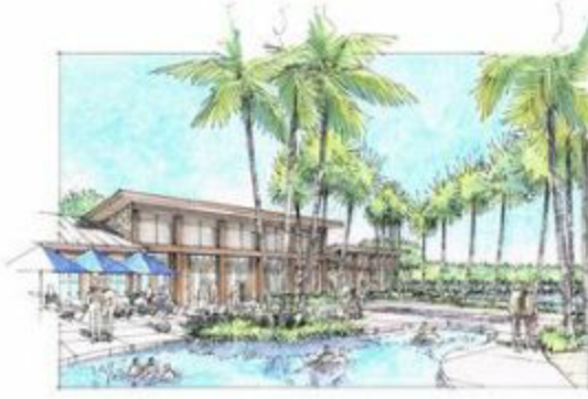
Artist rendering of the Clubhouse and pool at the new Guy Harvey Outpost Club & Resort Tarpon Springs.

The company's eco-friendly outposts typically feature amenities and programs tied to the beach, boating, fishing and diving. Its properties can be found in Islamorada, St. Pete Beach and St. Augustine, as well as in the Bahamas, Cayman Islands, Mexico and Galapagos Islands off Ecuador.