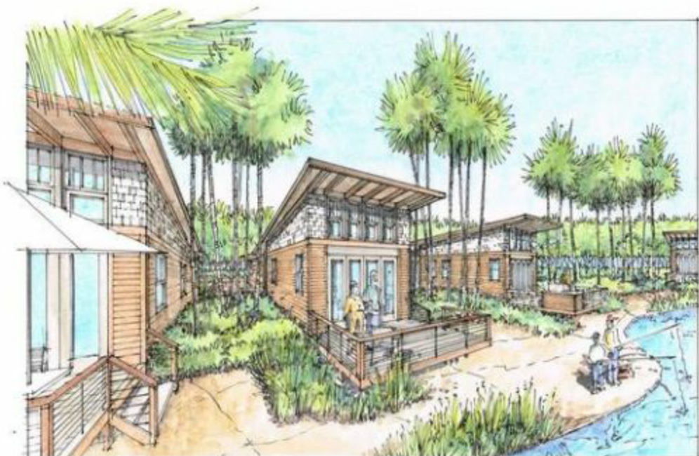
Artist rendering of the resort cottages for sale at the new Guy Harvey Outpost Club & Resort Tarpon Springs.