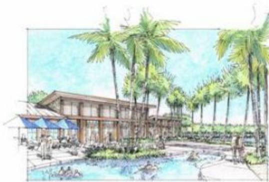
Artist rendering of the Clubhouse and pool at the new Guy Harvey Outpost Club & Resort Tarpon Springs.

The company's eco-friendly outposts typically feature amenities and programs tied to the beach, boating, fishing and diving. Its properties can be found in Islamorada, St. Pete Beach and St. Augustine, as well as in the Bahamas, Cayman Islands, Mexico and Galapagos Islands off Ecuador.