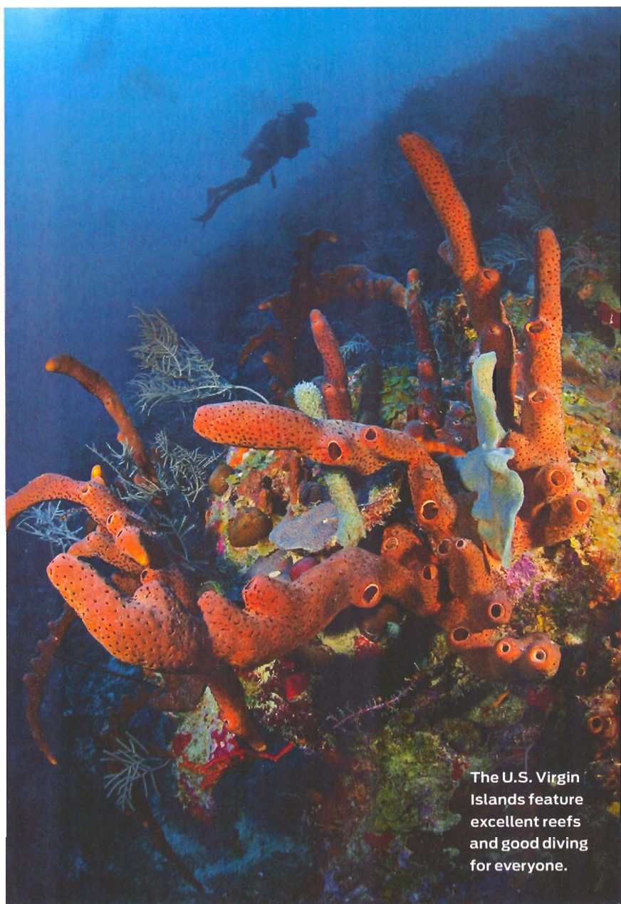
The U.S. Virgin Islands feature excellent reefs and good diving for everyone.

[ 1 U.S. Virgin Islands ] 2 Belize 3 Bahamas (New Providence and Grand Bahama) 4 Aruba 5 Bay Islands