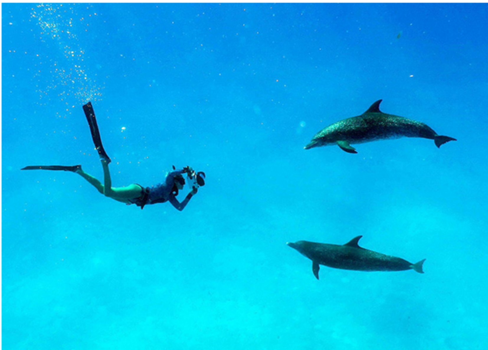
Jillian photographing wild dolphins.

As the bow of our boat slices through the crystal clear waters, we scan the horizon for fins. Bimini is famous for its eclectic history, but it is also known around the world for its amazing wild dolphins. Both bottlenose and Atlantic spotted are encountered frequently and offer visitors a unique glimpse into the lives of these fascinating creatures.