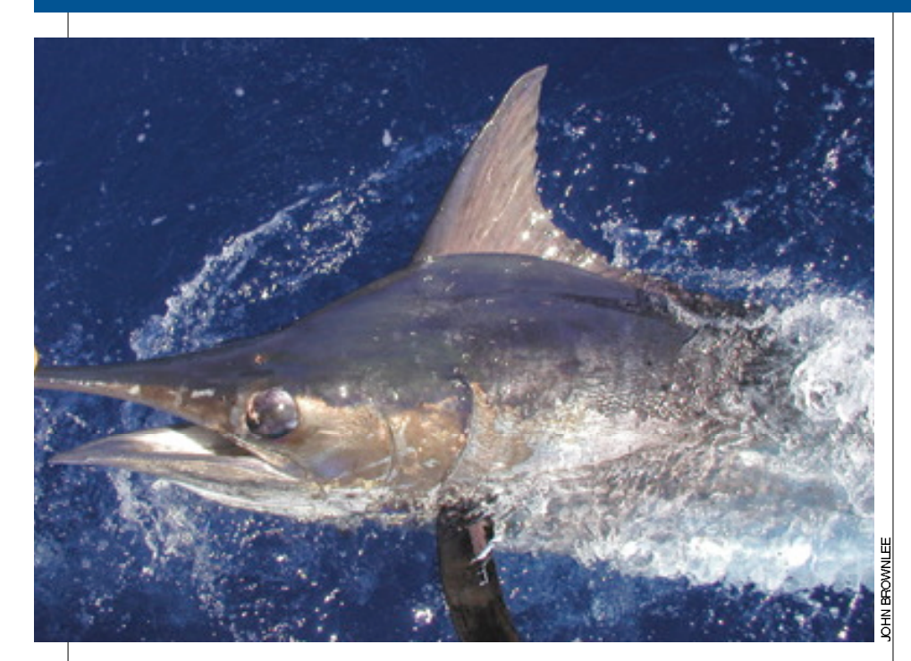
Blue marlin start showing up in March, but the action really heats up in June and July. Most of the boats troll combinations of baits and plastics.

melee, the cedar plug quickly got the nod as the shotgun line went down. Ben and I were alone on the boat and shorthanded. Before we could get the tuna under control on the shotgun, the long rigger bait, a horse ballyhoo behind a purple-and-black Ilander, came tight for a doubleheader.