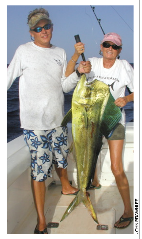
If the marlin bite slows to a trickle, you can always find a few bull dolphin for the grill.

and a luxury hotel, along with an upscale residential community with fine dining and shopping available. They even plan to add spa and fitness facilities. Rum Cay has a brand-new 4,500foot runway, built to accommodate such development. Find out more at www.rumcay.com.